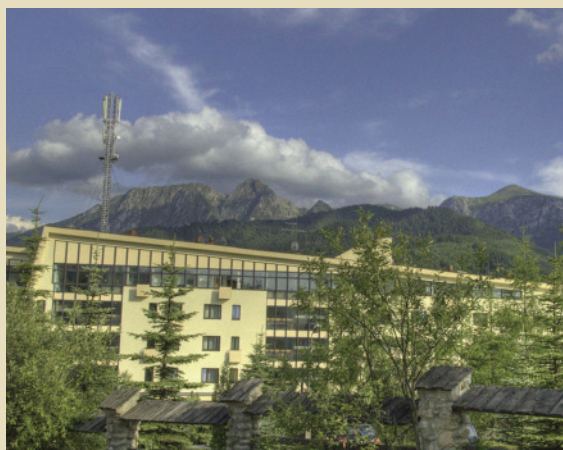
↑ Tatra Mountains, Hala Gąsienicowa. August 2012. ← Siwarna Hotel in Zakopane-Kościelisko.