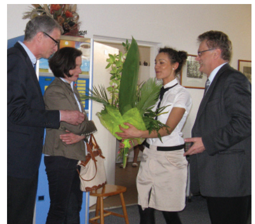
↑ The flowers for prof. Hirzebruch were handed to his son – Michael and his son's wife.

Regards and greetings from Fritz and Inge Hirzebruch