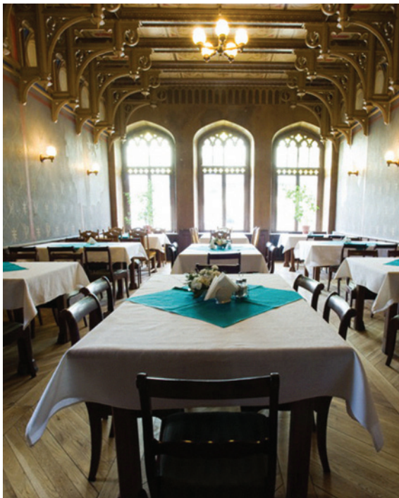
→ Interior of the Palace – dining room.

In 1997, the Institute of Mathematics acquired a neogothic palace together with a park in Będlewo near Poznań and built facilities for future mathematical conference center there. Since 2001 Będlewo Palace serves as a principal space of an activity for the Banach Center, where larger scientific events such as conferences and big workshops are organized. The premises