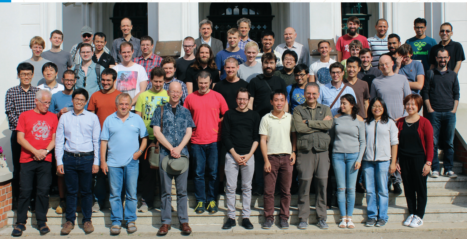
Participants of the Master Class in Będlewo