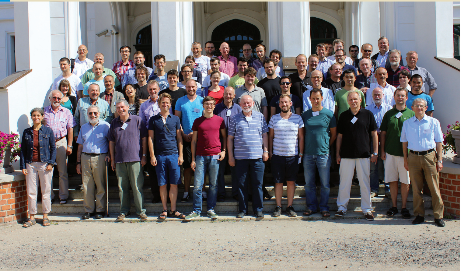
Participants of the conference