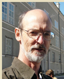
Organizers of the NCG Simons Semester